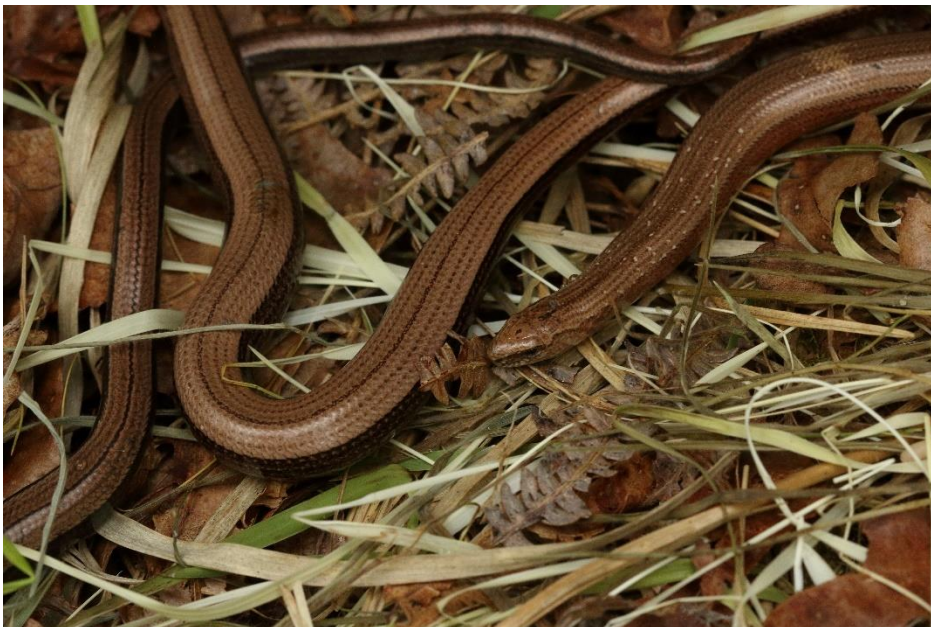
Slow worm recorded as part of the reptile transect surveys